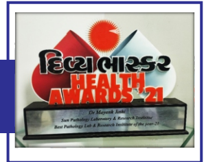
Best Pathology Lab

By Our Former Chief Minister Shri Vijaybhai Rupani