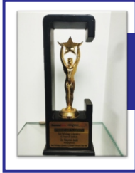
Pride Of Nation