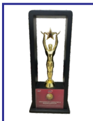
Pride of Gujarat

By Our Chief Minister Shri Bhupendrabhai Patel