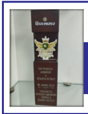
Legends Of Gujarat

By Shri Gyanvatsal Swami & Health Minister Shri Rushikesh Patel